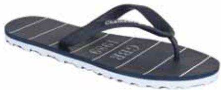
Navy / Navy