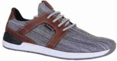
Grey / Tan