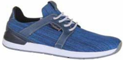
Blue / Navy