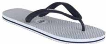
White / Navy