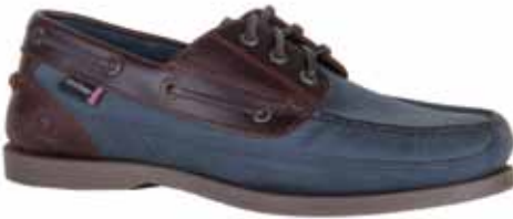
Navy / Dark Seahorse